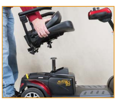
Step 1: Pop off the seat!