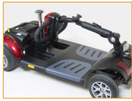
Step 3: Fold down tiller and lock in place!