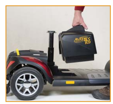
Step 2: Pull out the battery pack!