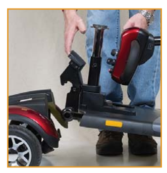
Step 4: Pull forward on the drivetrain release lever to separate the front and rear frame sections!