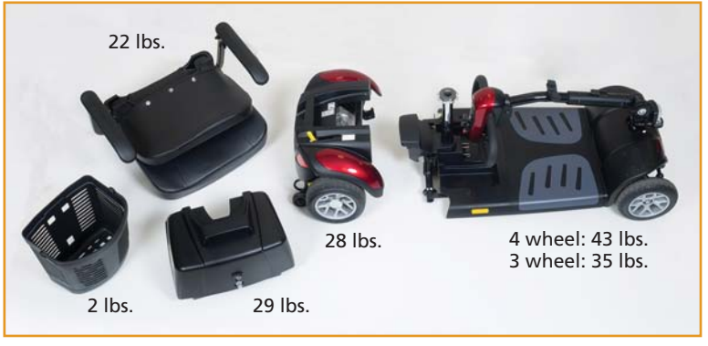
Disassembles into 5 pieces!